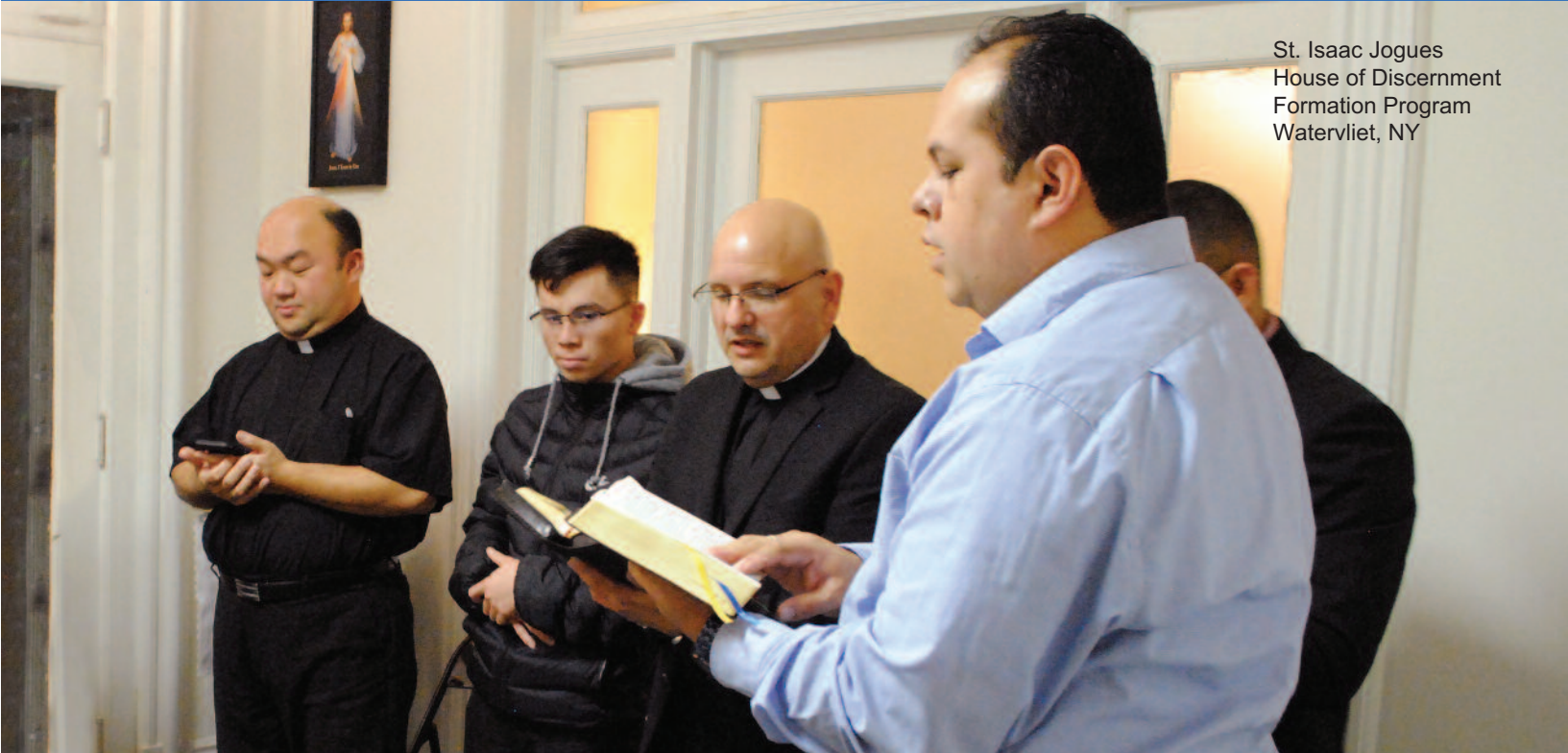
St. Isaac Jogues House of Discernment Formation Program Watervliet, NY

Donors may transfer their residence, farm or vacation home to The Foundation of the Roman Catholic Diocese of Albany subject to a life estate. The donor may continue to live in the property for life or a specified term of years while continuing to be responsible for all taxes and upkeep. The property then passes to The Foundation when the life estate ends.